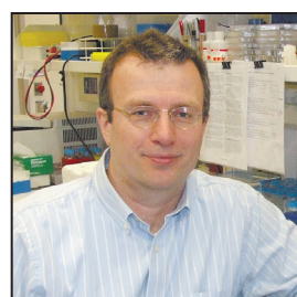
5 Parasite research