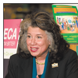
8 Book on feminism