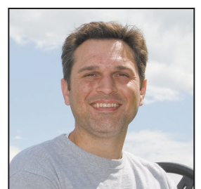
8 Mercury in fish