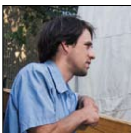
8 Alumni artwork