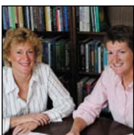
4 Disaster risk study