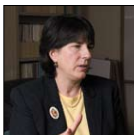
5 Monitoring meds