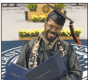
3 Five degrees