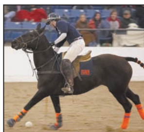
8 National champions